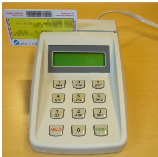
Figure 1.2: The numerical keyboard and a magnetic strip reader

Currently we have a running implementation of all systems but A (hence the non-name). The current implementation of Pidio utilizes a simple numerical keyboard and a magnetic strip reader, for danish health insurance card. To improve simplicity on the system, no identification is currently made of the operator (this is at the time being not mission critical data, but must be added at a later point due to documentation procedures)